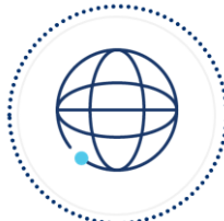
MassMutual Underwriting now using Swiss Re Life Guide