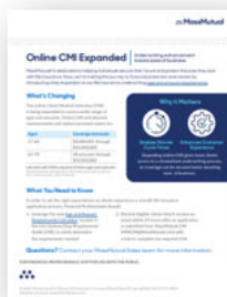
Online CMI expanded, paperwork streamlined