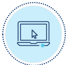
Faster medical record turnaround time