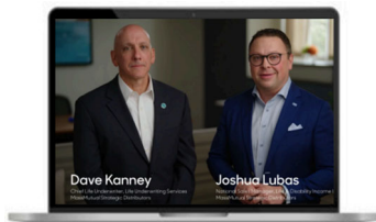
MMSD Retention and Capacity Strengths Video (3:20)